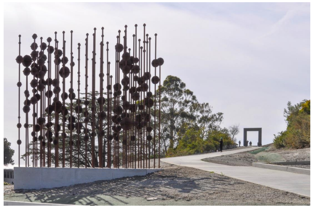
"Frame" & "Refrain" (Hunters Point, San Francisco)